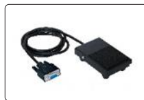
foot switch (optional)