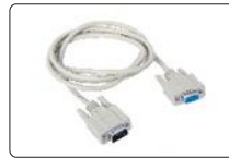
RS232 cable (optional)