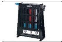
air filter (optional)